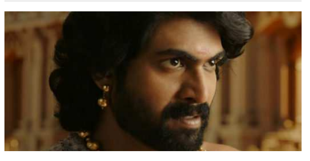
After Bhallaladeva, Rana To Play As King Hiranyakashipu