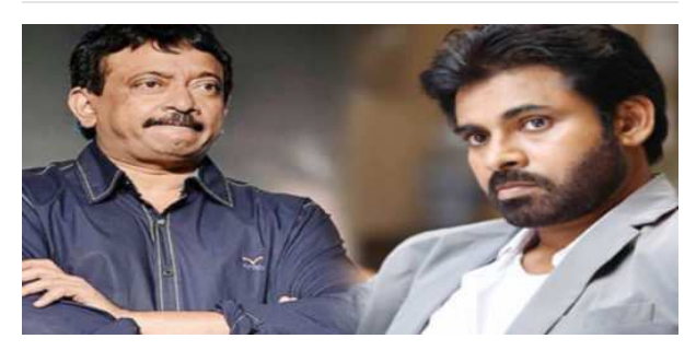
RGV Insults Power Star Pawan Once Again