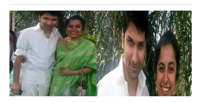
Actress Suhasini's Son Robbed in Venice