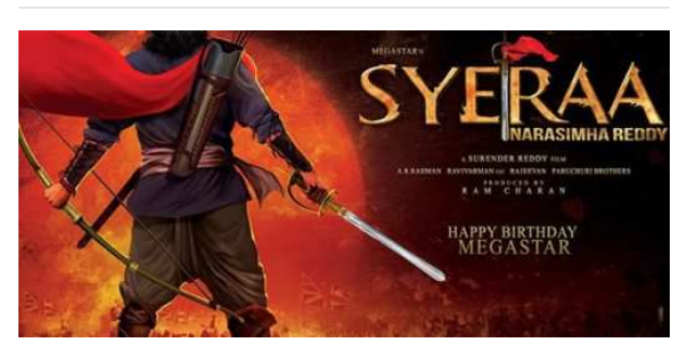
Chiru's 151 Movie Title Cleared